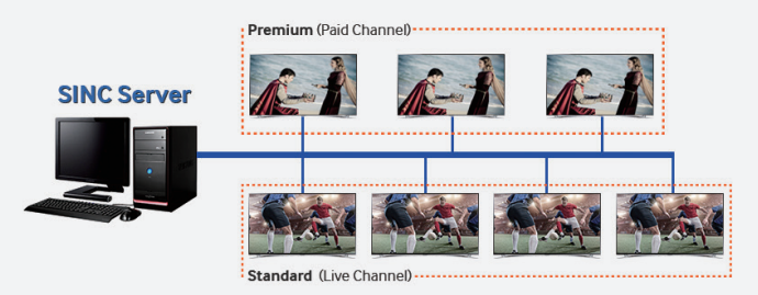
Figure 3. Hotels can organize guests into groups and manage message, channel and content per different groups or even individual guests

LYNK SINC 3.0 enables managers to assign various guests to groups that have similar sets of channels and content needs. Managers can create up to 10 groups of displays with dedicated content for each group, which is ideal for targeting a specific group of guests such as convention attendees.