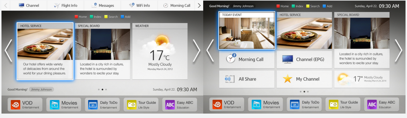
Figure 2. LYNK SINC 3.0 UI enables full customization for creating a unique hotel identity

The interface features a grid template where each or conjoining grids can be populated with content that hotels would like to offer their guests. The new interface offers a more detailed grid-type layout that enables hotels to design unique, highly customized home screens that promote branding and impress guests.